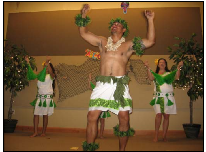
The Siva Maia group perform a traditional island dance.

Residents talked about this event for several days. We plan on making it an annual event and wish to invite the dancers back again. Aloha!