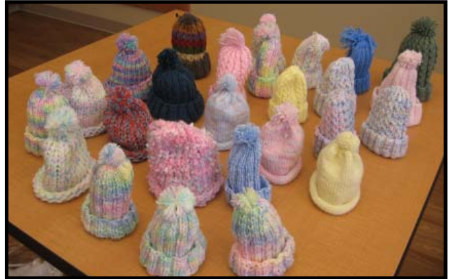
Caps created by volunteers dot the table.