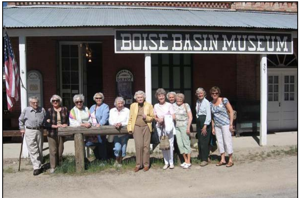
During a recent trip to Idaho City, residents and staff visited the Boise Basin Museum.