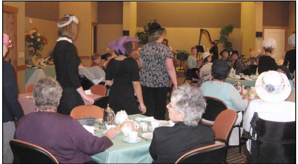
Members of the Touchmark staff and The Canyon County Historical Society showcase vintage hats during the recent tea.

The month culminated with a tea party featuring a vintage hat show. The Canyon County Historical Society presented vintage hats, some dating back to the 1800s. Each hat reflected a different era and a different set of values and style. ■